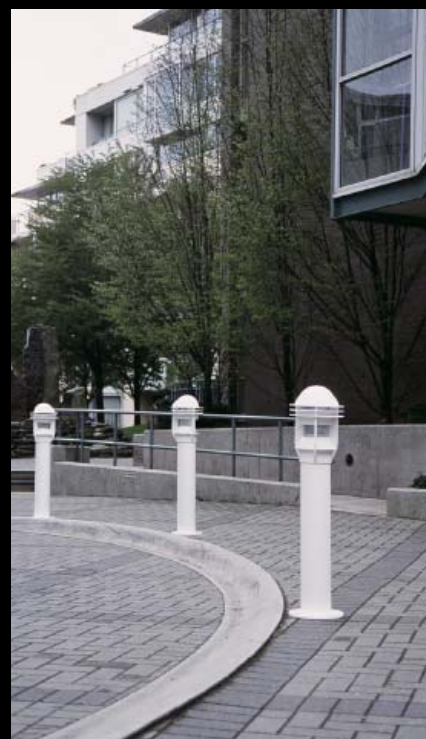
Landscape Bollard 4009