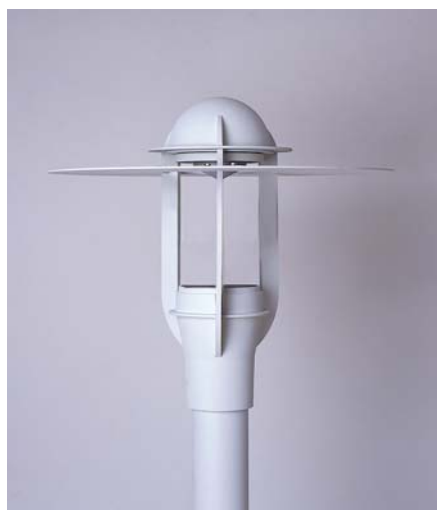
Post top model shown with reflector disk